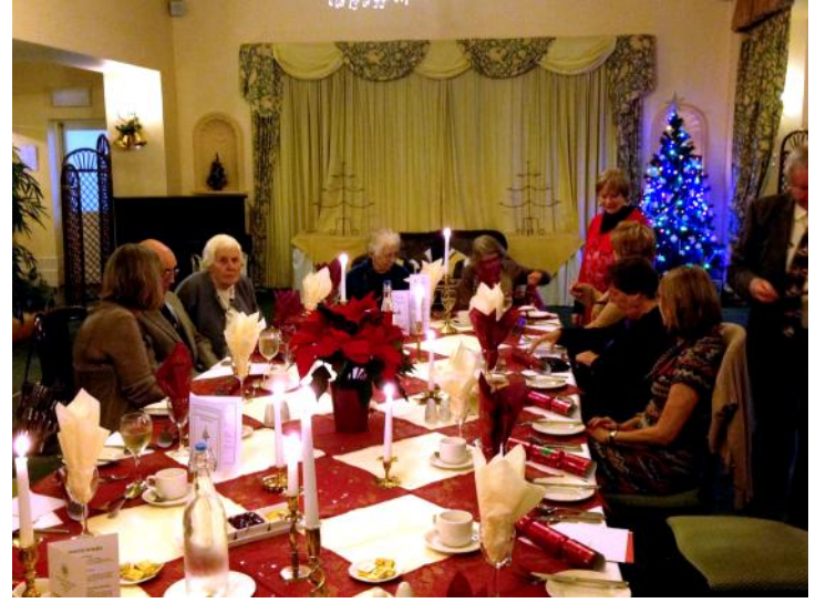
The superbly decorated table before we devastated it.