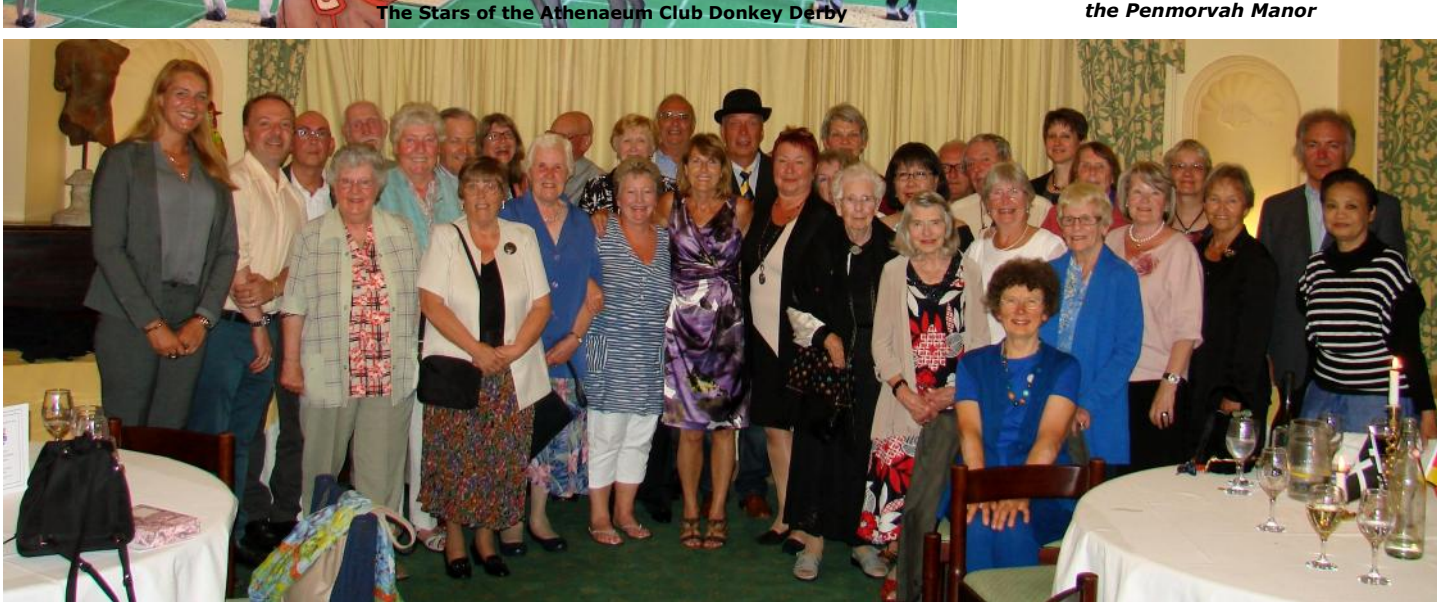
The Group photograph taken at the Official Reception at the Penmorvah Manor Hotel.