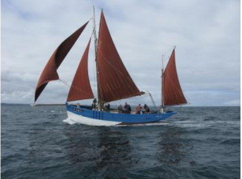
The 'Skellig' from Brittany arrived in Falmouth on 15th June to take part in the Classics